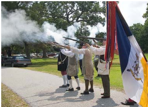
Below: a volley is fired in salute to the memory of William R. Davie