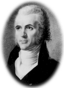
Above: Col. William R. Davie