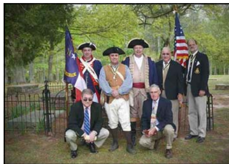
Some of the SAR participants at the 2007 celebration