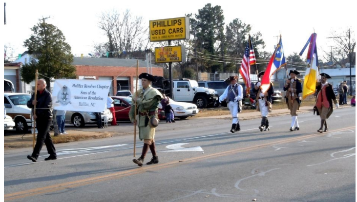
The NCSSAR Combined Color Guard leading the Roanoke Rapids Christmas Parade.