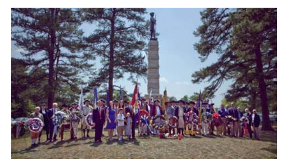
(above) The NCSSAR contingent