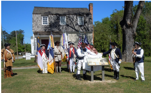
The marker dedication at the Owens House in Halifax, 4/7/2012