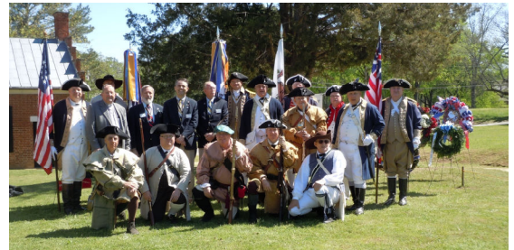
(l) the Flag Retirement ceremony held the morning of the Halifax Resolves celebration, 4/7/2012, and (r) the SAR participants in the ceremony