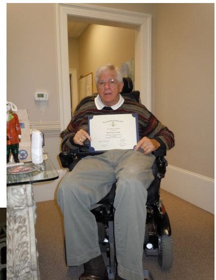
(below) Certificate of Appreciation to B shift of the Roanoke Rapids Fire Department for their participation and assistance in the recent flag retirement ceremony. (Sep 17)