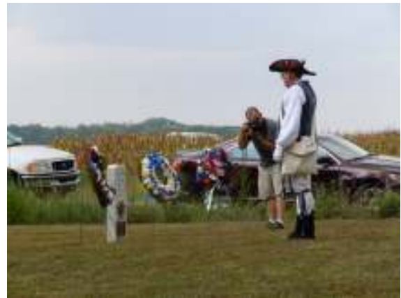
(top left) a collage of the activities