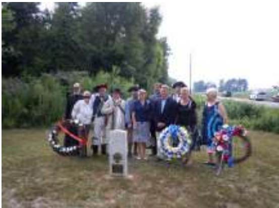
(bottom left) Some of the participants