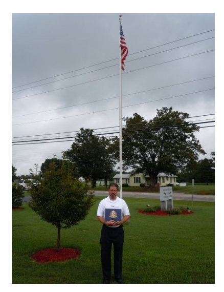
Aug 7 presentation of the SAR Flag Certificate to Hockaday Funeral & Cremation Service