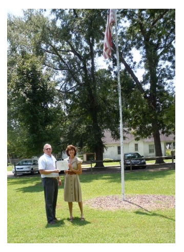
Jul 25th presentation of the SAR Flag Certificate to the Halifax Library

July 25th presentation of the SAR Flag Certificate to Iluka Resources of Roanoke Rapids