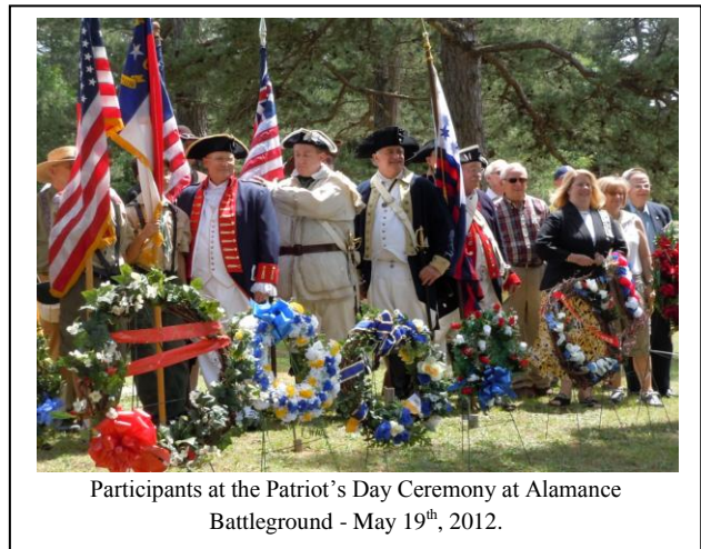
Participants at the Patriot’s Day Ceremony at Alamance Battleground - May 19 th , 2012.