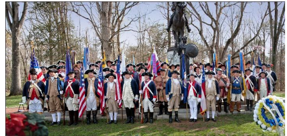
SAR Contingent at the Battle of Guilford Courthouse March 17, 2012