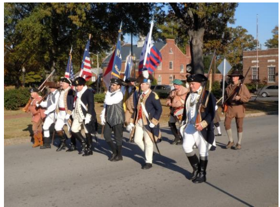
The Combined NCSSAR Color Guard led the "March of Patriots" Veterans Day Parade on November 11 th .