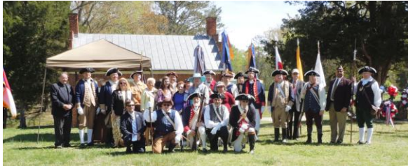
Participants in the 239 th Anniversary Celebration of the Adoption of the Halifax Resolves