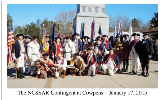
The NCSSAR Contingent at Cowpens – January 17, 2015