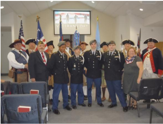
The Combined NC SAR Color Guard with AMVETS 101 and Roanoke Rapids HS AJROTC.