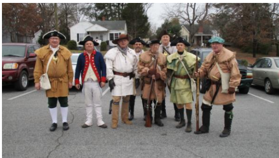
NC SAR & NC SR Color Guard members at the December 4 th Roanoke Rapids Christmas Parade