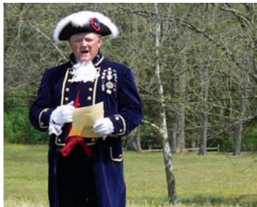
Below: the Halifax Town Crier reads aloud the Halifax Resolves