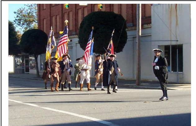
The NCSSAR Color Guard leads the "March of Patriots" Veteran's Day Parade. November 7, 2010