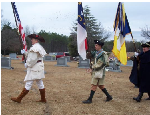
Chapter Color Guard presents the colors at the Wreaths Across America ceremony December 11 th .