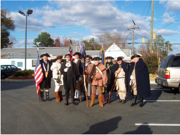
NCSSAR Contingent at the Roanoke Rapids Christmas Parade Dec. 5 th

member of the Color guard and also presented a wreath in memory of all who died during the attack.