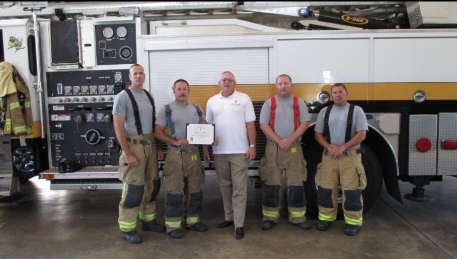
Roanoke Rapids Fire Department "C" Shift – support of flag retirement ceremonies