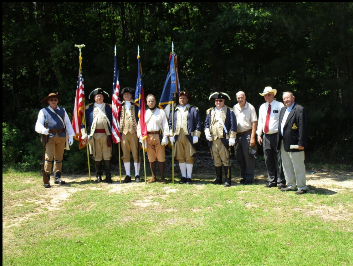
The NC SAR Contingent

Sponsored by the Elizabeth Monfort-Ashe Chapter NC DAR