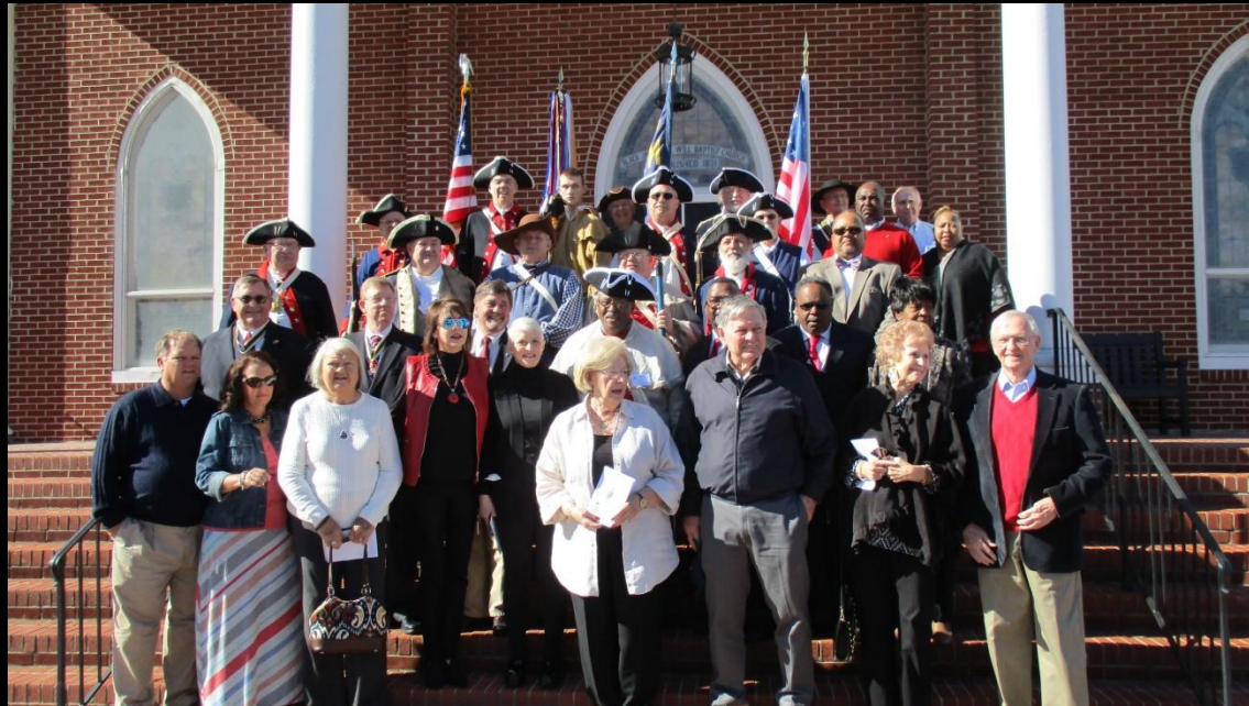
SAR, DAR and Mills family members