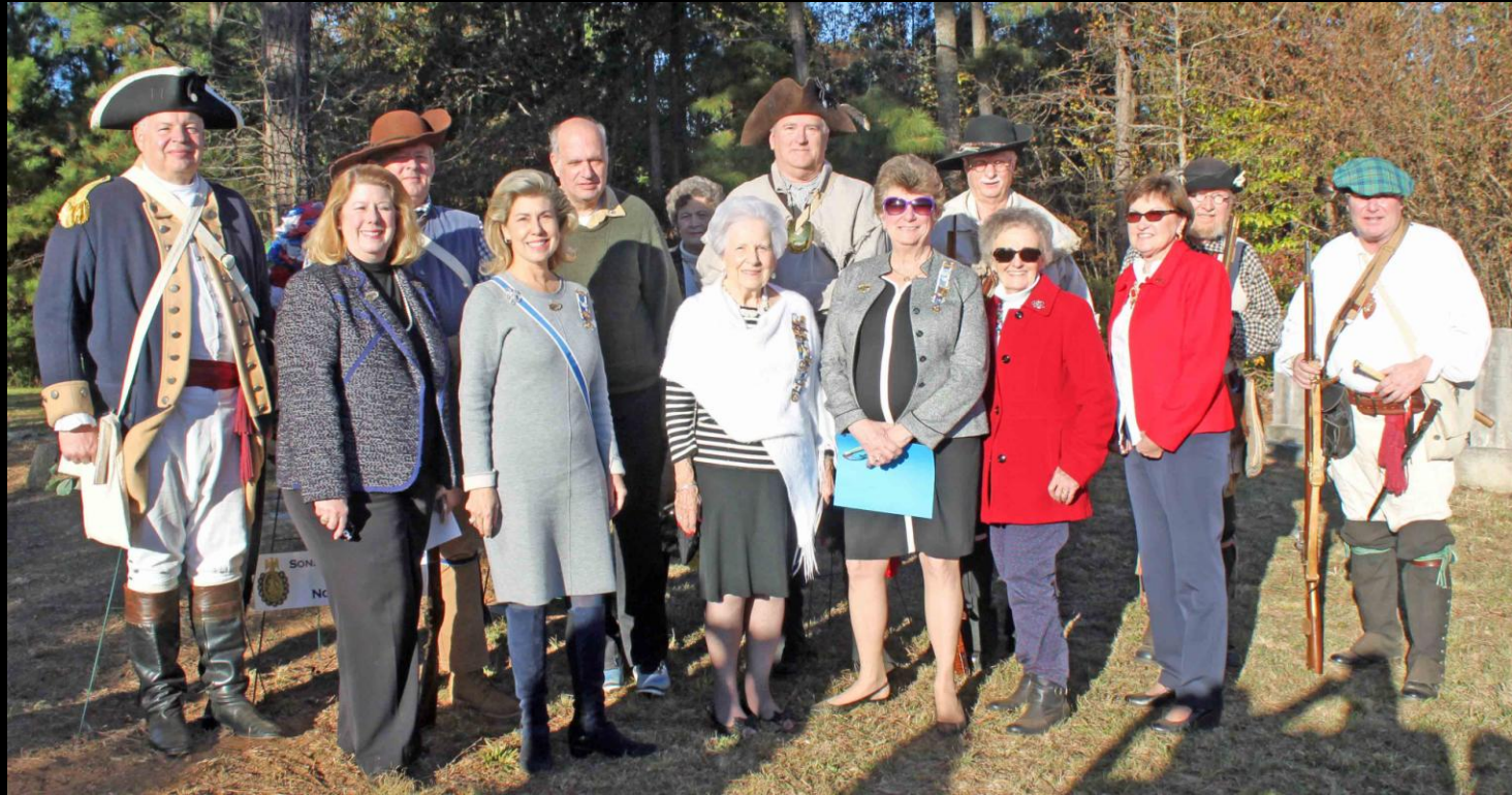
DAR, SAR & SR participants