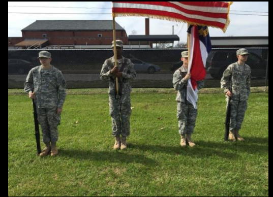
RRHS AROTC Color Guard