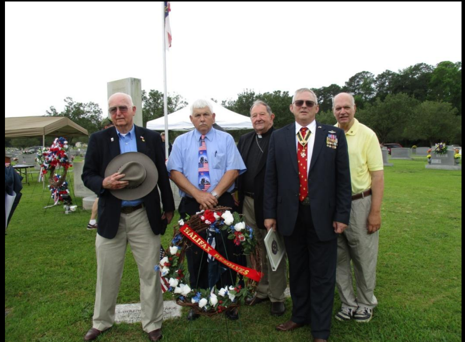
Chapter Members present at the Memorial Day Ceremony