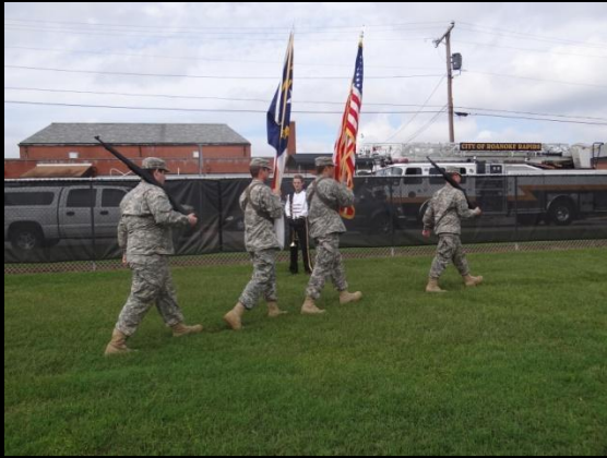
RRHS Jacket Battalion AFRCC Color Guard posted & retrieved the Colors