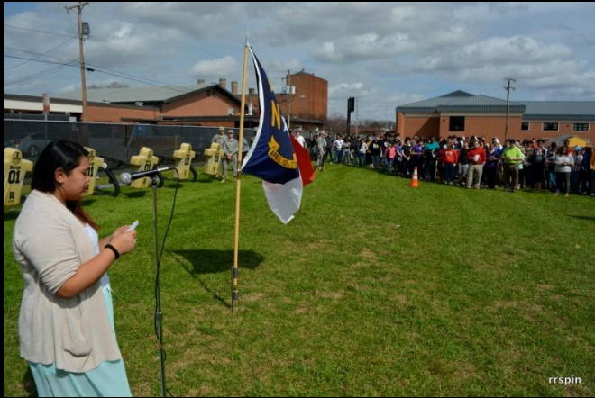
Program written and conducted by the students