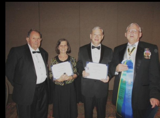
The Halifax Resolves representatives display individual and chapter awards received