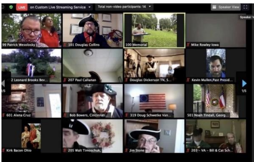
Screenshot of Battle of Blue Licks Ceremony