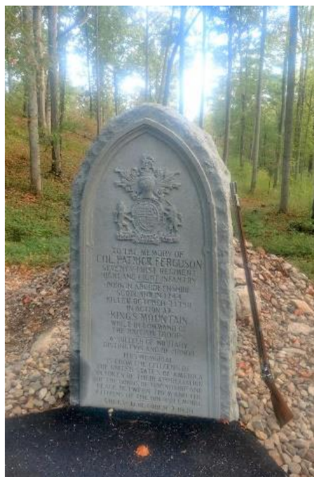
Tombstone for Colonel Patrick Ferguson, commander of the British troops at Kings Mountain.

Independence. Thomas Jefferson called the battle "the turn of the tide of success." The loss of Ferguson's force prompted Cornwallis to temporarily abandon his offensive in North Carolina and permanently shifted the initiative to the Americans in the South. Ultimate American victory in the Revolutionary War was barely more than a year away - and the men who marched over the mountains on October 7, 1780, made a huge contribution to securing the promise of Liberty as laid out by the Declaration of Independence.