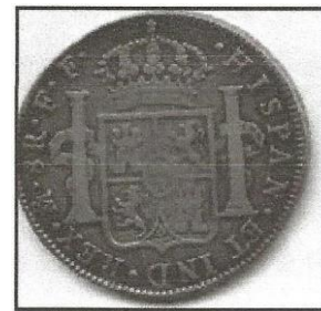
Spanish Milled Dollar Reverse, 1781

The origin and significance of the dollar ($) sign is yet another part of our wonderful Spanish heritage in America that has somehow been lost, forgotten, or obscured.