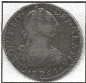
Spanish Milled Dollar Obverse, 1781

The “S” alludes to Spain and the two vertical marks “ II ” allude to the pillars of Hercules. Shown below is a “Spanish milled dollar”, or Peso , that was minted in Mexico City in 1781, the year that the Spanish and French forces commanded by General Bernardo de Galvez fought and won the Battle of Pensacola. On the obverse, or front side, is an image of King Carlos III. On the reverse is the image of the royal coat of arms flanked by the Pillars of Hercules, which adorned most Spanish coins of the period.